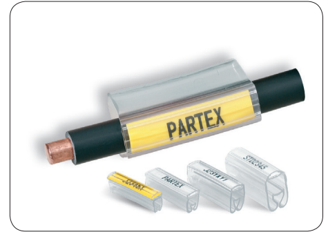
Printed marker tags mounted in sleeves.