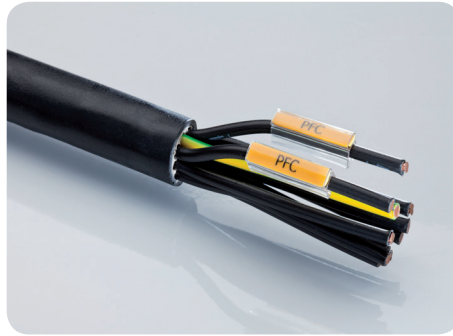
PFC in PT+PFC sleeve